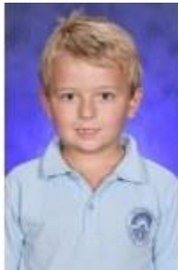
1 - Fletch M. 3/4C

Matt S. - 6J - Excellence in imaginative writing.